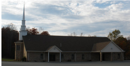
Westlake Baptist Church